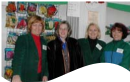
Farm Store Consultation, Kiev Ukraine